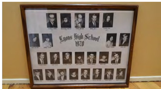
Class of 1970, Lyons HS, 50th Reunion 2020