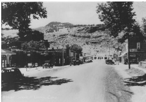
Main Street, Lyons, circa 1930s