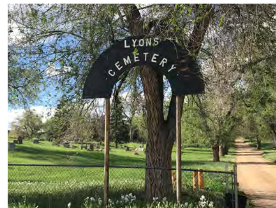
Lyons Cemetery, 2020

Virtual Exhibit. The history of Lyons told through the stories of 40 artifacts. The museum exhibit, was developed in 2019 to celebrate the Museum's 40th Anniversary. Comprised of objects, photographs, and documents this virtual exhibit showcases the depth and breadth of the Museum's collections. To explore go to: https://virmuze.com/m/lyons-redstone-museum/