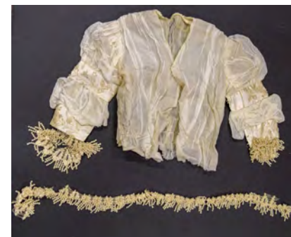
Detail of Wedding Attire, c.1900

Virtual Exhibit. Learn the history of the Lyons Cemetery and the stories of some of those buried there in this new digital exhibit of our popular walking tour of Lyons history. Find out about the oldest existing markers from July & October 1890 and learn the significance of symbols and emblems found on some headstones. To explore go to: https://virmuze.com/m/lyons-redstone-museum/