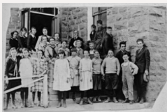
Lyons 7th & 8th Grades, 1918-19

DONATIONS NEEDED. The COVID-19 has caused the LRM to be shut down which has had a significant financial impact in 2020. The museum relies on sales and donations for funding its operations every year. We ask for your support during this time. Tax exempt donations may be sent to the Lyons Historical Society, P.O. Box 9, Lyons, CO 80540.