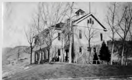
Lyons Schoolhouse, 1921