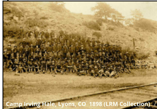
Camp Irving Hale, Lyons, CO 1898