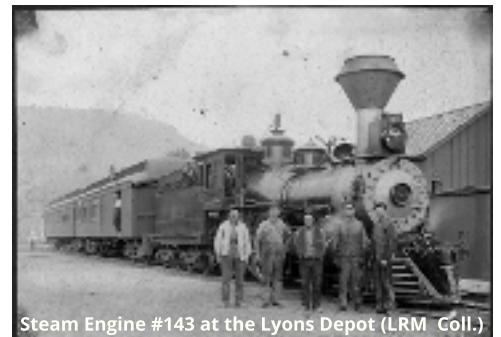
Steam Engine #143 at the Lyons Depot

Throughout the summer: Watch for updated favorite exhibits on Lyons' schools & people