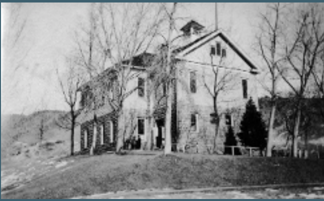
Lyons Schoolhouse, 1921